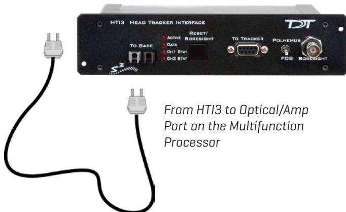
From HTI3 to Optical/Amp Port on the Multifunction Processor

Important! Both ends of the cable are the same but the two sides of the connector are different. See the illustrations below to determine the correct way to make the connection for the Headtracker Interface.